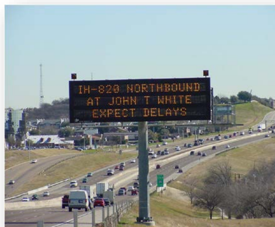
Dynamic Message Signs provide travel-time estimates and other information to improve commutes.

the RTC. If construction does not begin by the agreed upon deadline, funding will be removed from the project and returned to the regional pool for use on other projects. Of the 57 projects identified on the initial Milestone Policy list, 50 have advanced to construction, 6 were canceled, and 1 continues to be monitored. Since that time, staff has begun the process of implementing a second round of the MPO Milestone Policy. Projects funded between 2006 and 2010 that have not advanced to construction were identified and project sponsors have been asked to confirm their commitments to the projects and propose new project schedules.