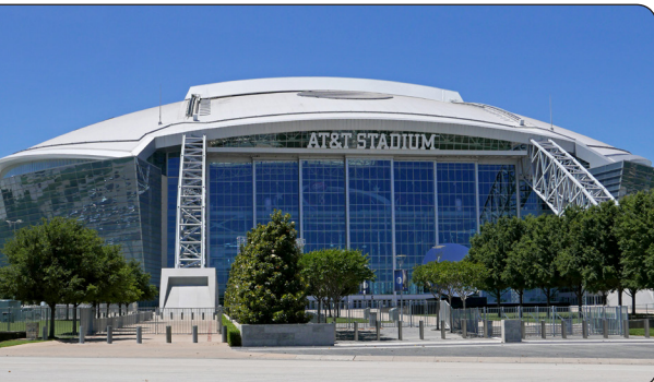
AT&T Stadium™ (above); Globe Life Field™ (right); American Airlines Center™ (below)