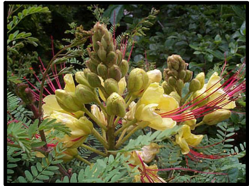
Birds of Paradise