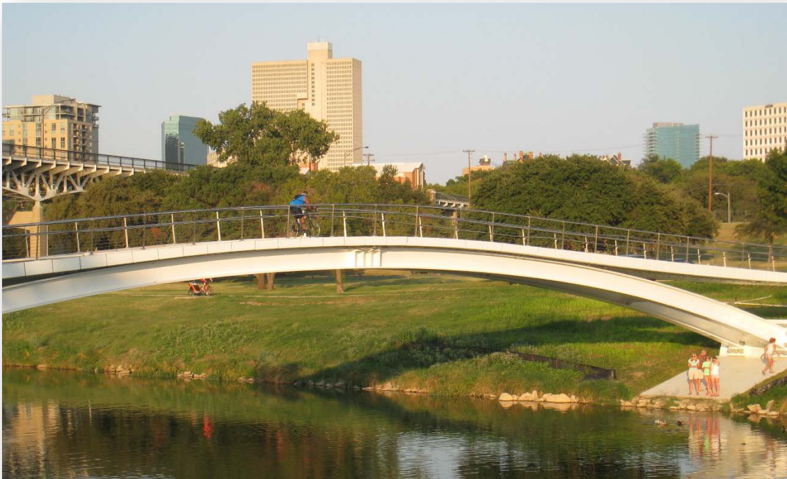
Trinity River Pedestrian Bridge in Fort Worth

In nonattainment areas, single occupant vehicle (SOV) capacity improvements must be included in a congestion management process. In addition, the resulting SOV projects must utilize management strategies such as travel demand reduction and operational management strategies as appropriate for the corridor. Projects that have advanced beyond the National Environmental Policy Act (NEPA) stage prior to April 6, 1992, and which are actively advancing to implementation, are not subject to this provision. Additional information on the CMP is provided in Appendix E.