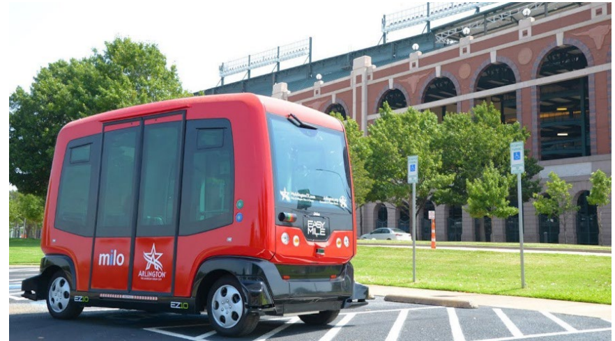
The city of Arlington operates the Milo autonomous vehicle during events in the Entertainment District.

unexpected road blockage. Teleoperation involves the actual driving of a vehicle by a remote operator using a robust communications network.