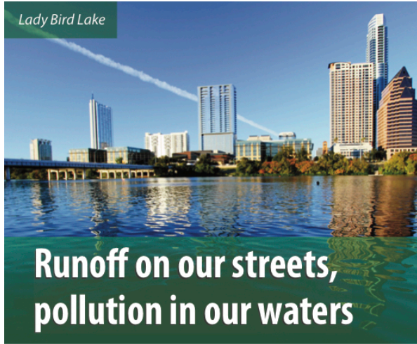
Lady Bird Lake