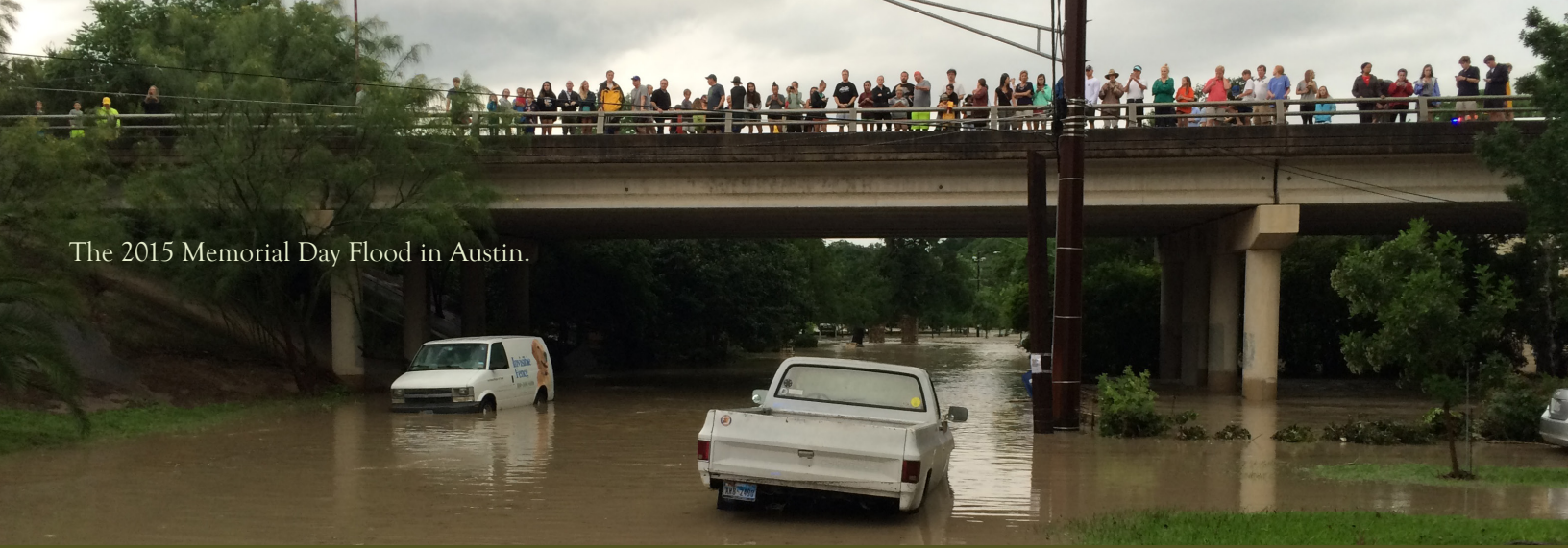
The 2015 Memorial Day Flood in Austin.