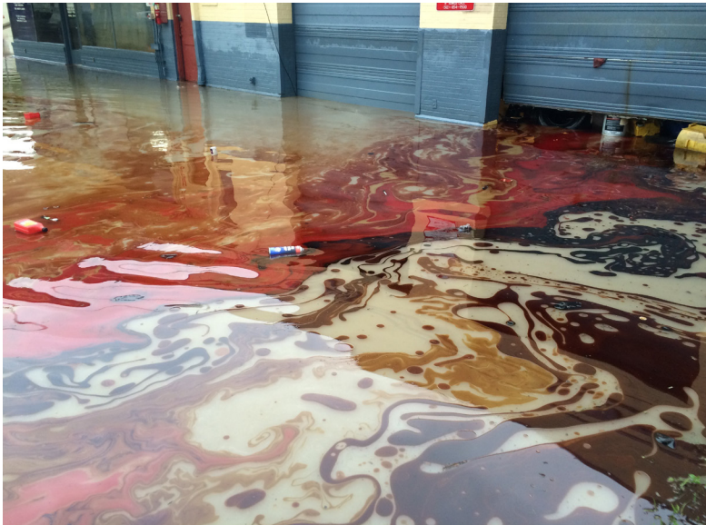
Stormwater mixed with automotive fluids at a service station during the 2015 Memorial Day flood in Austin.

Heavy rains have increased 67 percent in the city of Austin since 1950. Texas has lost more lives to floods than any other state over the last 20 years, and Austin has been hit particularly hard. Onion Creek has flooded twice since 2013, and the area is vulnerable enough to future flooding that the city has started buying out at-risk homes.