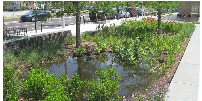
Beyond absorbing and filtering stormwater, rain gardens add natural beauty to developed areas.