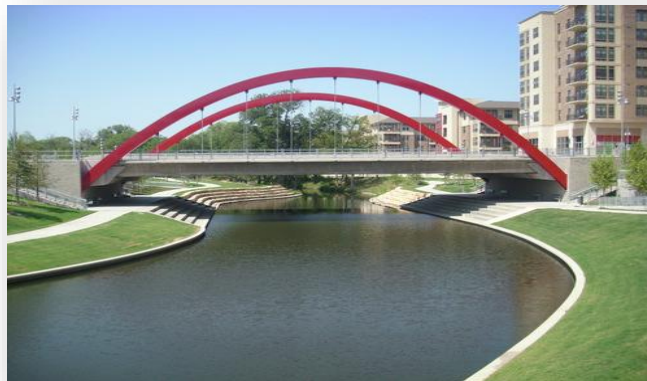
Vitruvian Park Trail in Addison

In nonattainment areas, single occupant vehicle (SOV) capacity improvements must be included in a congestion management process. In addition, the resulting SOV projects must utilize management strategies such as travel demand reduction and operational management strategies as appropriate for the corridor. Projects that have advanced beyond the National Environmental Policy Act (NEPA) stage prior to April 6, 1992, and which are actively advancing to implementation, are not subject to this provision. Additional information on the CMP is provided in Appendix E.