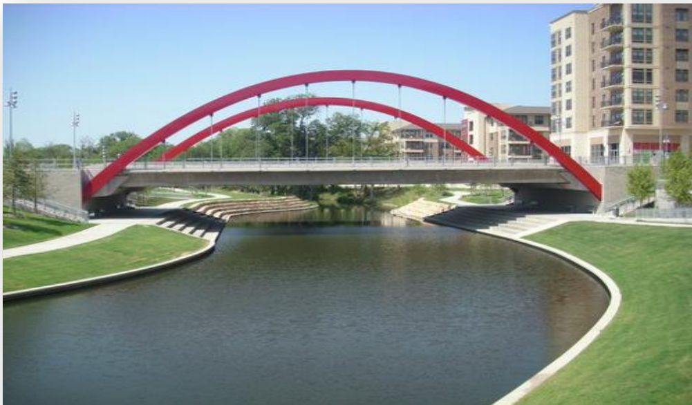
Vitruvian Park Trail in Addison

In nonattainment areas, single occupant vehicle (SOV) capacity improvements must be included in a congestion management process. In addition, the resulting SOV projects must utilize management strategies such as travel demand reduction and operational management strategies as appropriate for the corridor. Projects that have advanced beyond the National Environmental Policy Act (NEPA) stage prior to April 6, 1992, and which are actively advancing to implementation, are not subject to this provision. Additional information on the CMP is provided in Appendix E.