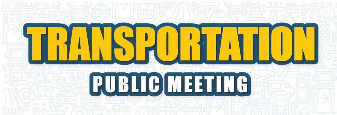
Exhibit II-1. Transportation Public Meeting Flyer for March 2022

MARCH 14 · NOON · 616 SIX FLAGS DR. ARLINGTON, TX