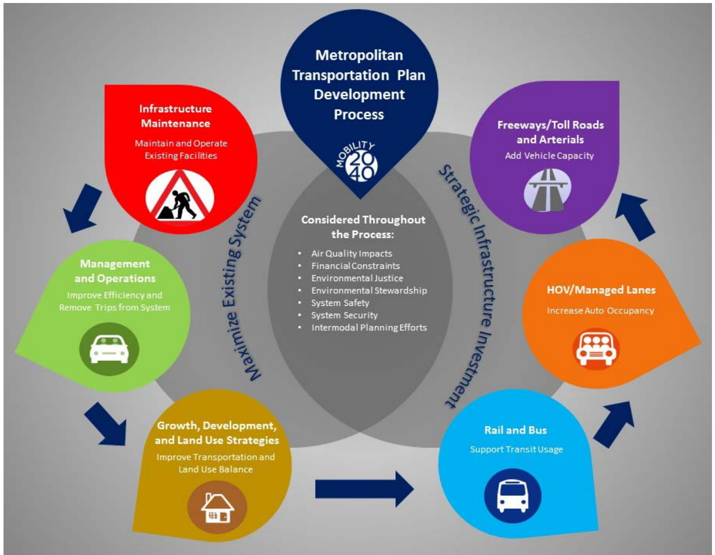
Exhibit C-2 – Plan Development Process